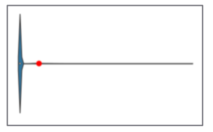
Typing speed when adding new payee

The user's typing speed when inputting the payee's details in a voice scam session (red dot) is anomalous, indicating hesitation.